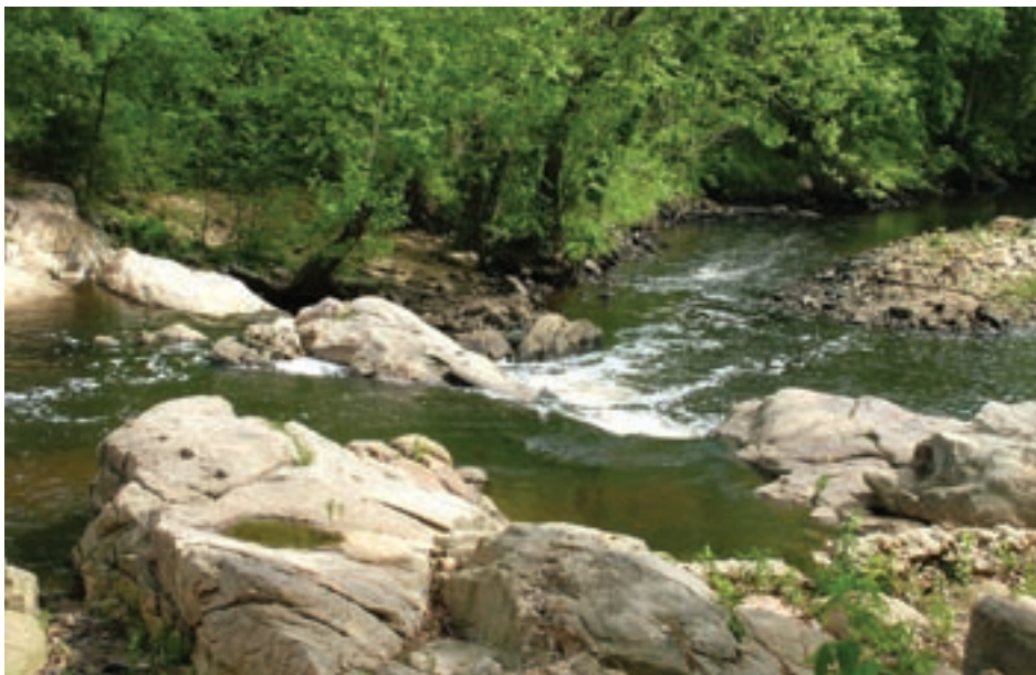
The falls at Falling Creek provided the power needed for the production of iron.

tlers from 1619-21. During these uneasy days, Opechancanough began to sound out support from the Powhatan tribes and allied nations to resume warfare with the English. Former Virginia Governor George Yardley, Governor Francis Wyatt, and Opechancanough continued diplomacy to resolve issues with each other, but the death of Nemattanew, known to the English as “Jack of the Feather” due to his distinctive feathered battle dress, during the fall of 1621, turned the Powhatan efforts to strike the following spring.