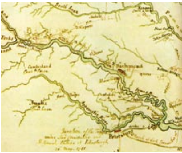
This map depicts the March of the Army under Cornwallis on July 12, 1781. The map is unsigned, but is done in the style of Capt. Edward Fage, Royal Artillery, who fought here in 1781.

The levies, with 50 additional men at the courthouse marched to North Carolina in late February, the second regiment to reinforce Gen. Greene's army in the South. In addition, two brigades of Virginia militia under generals Stevens and Lawson also joined Greene at this point, allowing the battle of Guilford Courthouse, N.C.,