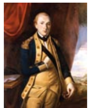
This portrait is of Gen. Lafayette done by Charles Wilson Peale.